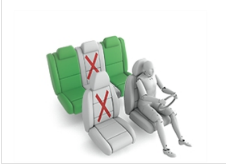
BeSafe iZi Kid X3 ISOFIX (ISOFIX)