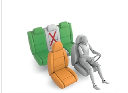
Maxi Cosi Cabriofix & EasyBase2 (Belt)